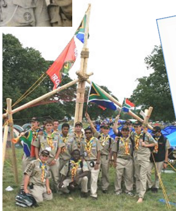
2007 Scouting Centenary. Pongola Troop Hylands Park, England.